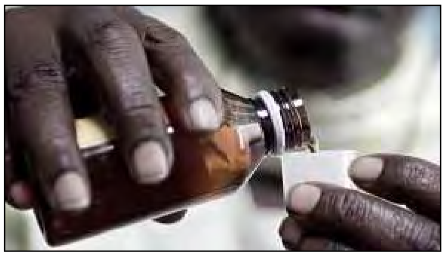
Figure 5: Anti-retroviral drug therapy