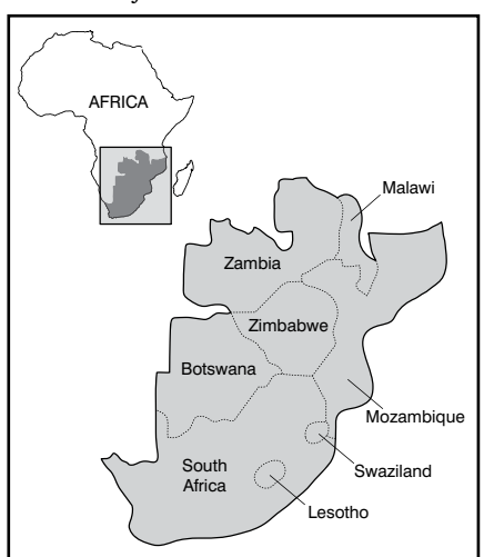
Figure 3: Case study countries in sub-Saharan Africa

million people (Figure 3), one in four of the population is infected with HIV/AIDS. When those who are economically active die or become too sick to work, there is less food and money available for their family, leaving them more likely to become ill and unable to afford medicine and health care. Premature adult deaths have left a youthful population, with 39 per cent under the age of 14. Increasingly, orphans are being cared for by grandparents or, if these too have succumbed to the disease, left to fend for themselves. Stuck in poverty, these young people become increasingly likely to indulge in behaviour that will see them infected as well. On a larger scale, the declining economy and the increasing proportion of government funds needed to combat HIV/AIDS is setting back the longterm development of an already very poor country.